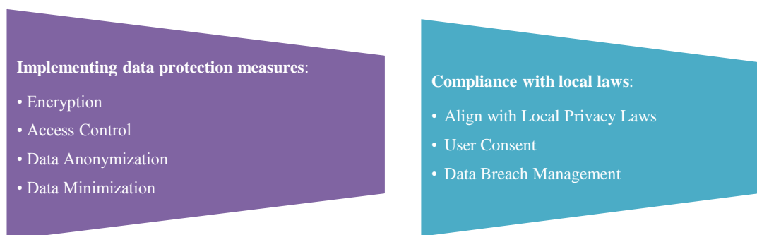
Figure 3. Implementation of Data Protection and Privacy

By following the steps provided in Figure 3, organizations can ensure the protection of user data and compliance with privacy laws. This helps users gain trust and confidence in the secure and responsible handling of their data. Implementing these data protection measures and adhering to local regulations are critical components of the DEM-GCC framework, contributing to the overall goal of fostering a secure and trustworthy digital economy in the GCC region.