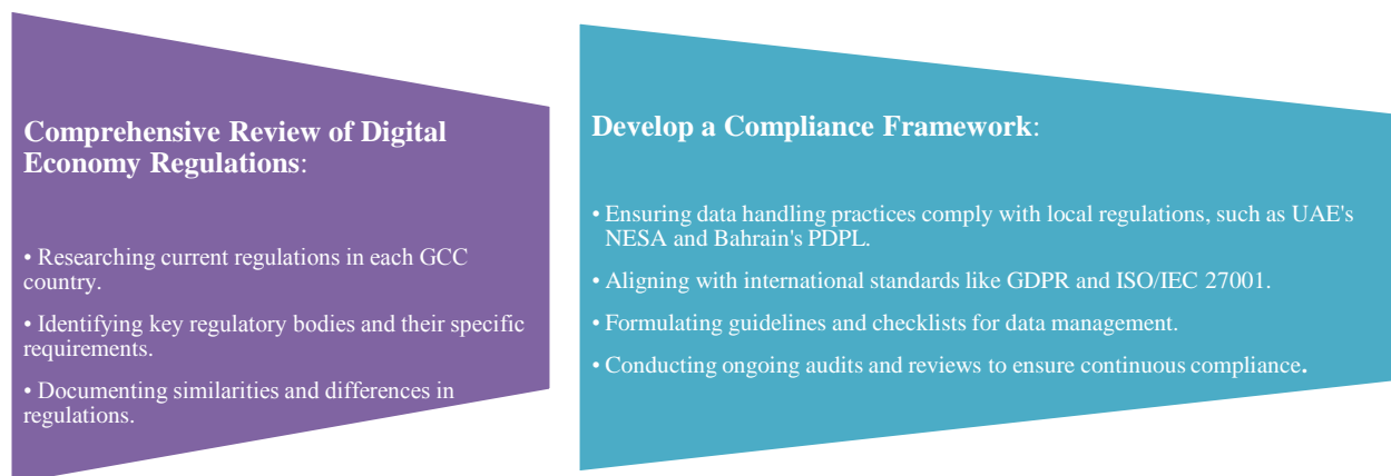
Figure 2. Regulatory and compliance strategy

A key requirement for this project's success is to ensure that the proposed framework for DEM-GCC adheres to the diverse regulatory environments of GCC countries and aligns with international standards. To achieve this, we follow a structured approach (Figure 2) that involves comprehensive research, the development of a compliance framework, and ongoing audits and reviews.