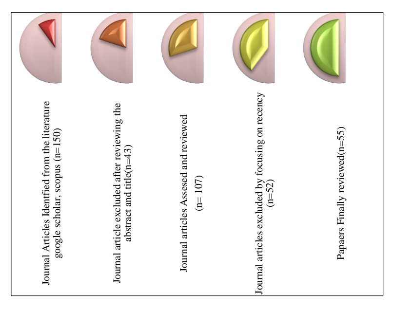
Figure 1. A flowchart depicting the process of conducting a literature review