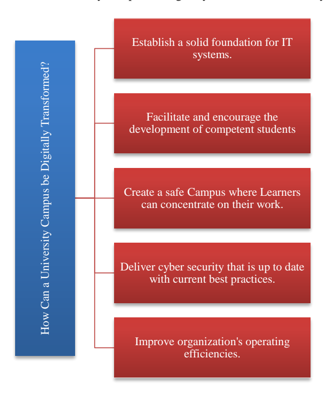
Figure 3. How Can A University Campus Be Digitally Transformed?

The "metaphorical walls and gates that have defined higher education are crumbling" because of the digital change that is currently taking place [23]. To avoid the same outcome, the literal walls and gates, as well as the physical campuses, will need to be rethought. Even if they are breathtaking, steeped in history, and full of symbolism, those qualities alone won't be enough. The grand country estates of England will become the American counterpart of museums of a bygone golden age, and those locations that are attractive but do not provide educational value will become the grand country estates of America. This is a crucial time for people who believe that true higher education must include the communal activities that take place on a traditional college campus. Leaving things as they have always been and failing to modify the facility's trajectory promptly will put the institution in jeopardy. In the following Figure 3, we attempt to answer the question, Can a university campus be digitally transformed? in many ways.