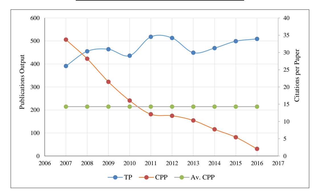
TP=Total Papers; TC=Total Citations; CPP=Citations Per Paper